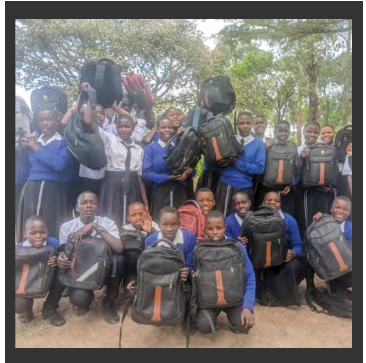
Kisangura Secondary School Students