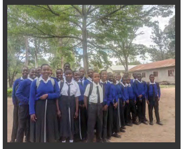
Kisangura Secondary students in the school courtyard