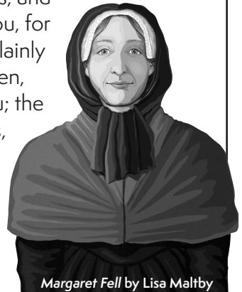
Margaret Fell

“Now, Friends, deal plainly with yourselves, and let the eternal Light search you, and try you, for the good of your souls. For this will deal plainly with you. It will rip you up, and lay you open, and make all manifest which lodges in you; the secret subtlety of the enemy of your souls, this eternal searcher and trier will make manifest. Therefore all to this come, and by this be searched, and judged, and led and guided. For to this you must stand or fall.” — Margaret Fell